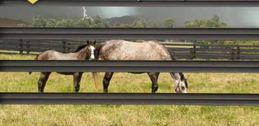
Storm Cat foal protected by Centaur® Fencing.

Whether you have a Storm Cat foal in your paddock or a storm looming on the horizon, Centaur® fencing is your best insurance policy. Centaur® fencing has a heritage of safety and quality in the equine industry. For decades, horse owners have trusted Centaur's advanced engineering for the security of their horses. Centaur® fencing offers traditional looks without the traditional problems.